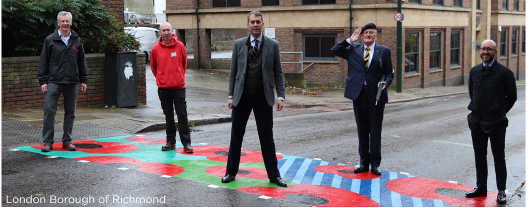
London Borough of Richmond

SPECIALIST SURFACING ENQUIRIES: 0800 600 700 specialist.surfacing@fmconway.co.uk